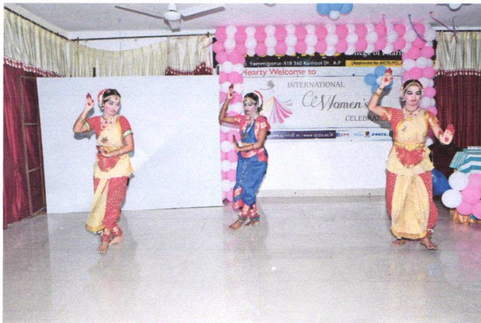
Students Dance Performance On Womens Day Celebrations