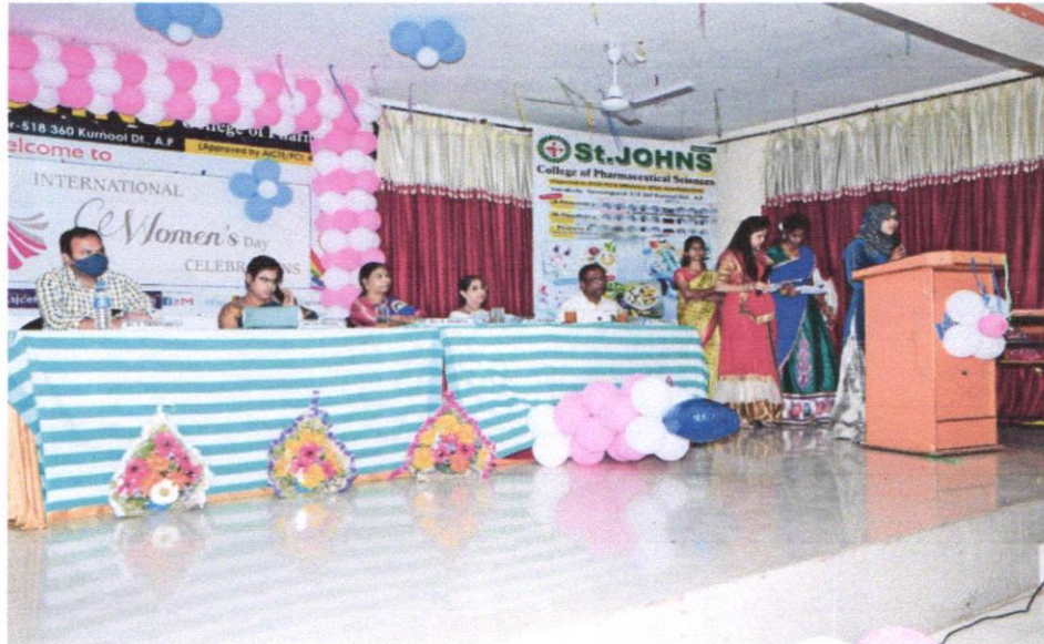
Student speech on Women Empowerment